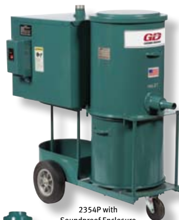
2354P with Soundproof Enclosure