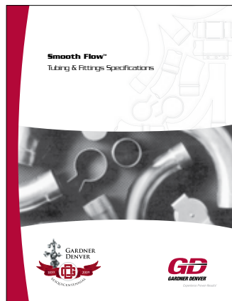
SmoothFlow Tubing and Fittings GDCF-6-100