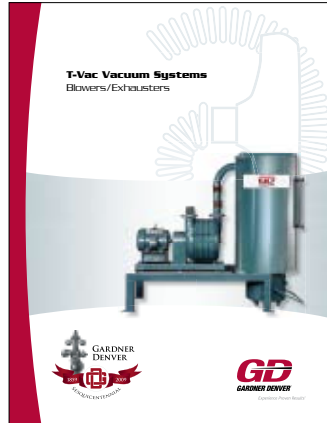
T Vac Vacuum Systems GDCF-1-230