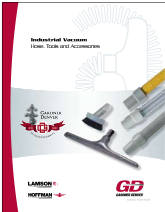
Industrial Vacuum Hose, Tool, and Accessories GDCF-1-205