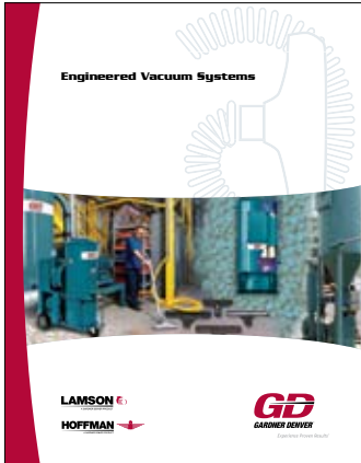
Engineered Vacuum Systems GDCF-1-200